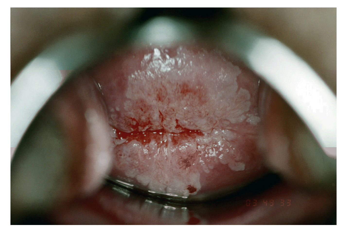
Figure 2. Atypical squamous metaplastic tissue in adolescent (after application of 3% acetic acid)