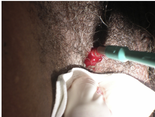
Fig. 3. Stop the downward pressure and remove the instrument as soon as the instrument completely penetrates the subcutaneous fat.