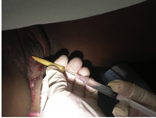
Fig. 8. The bulb of the catheter is inflated through the stem with 3 mL of sterile saline or gel, as air may prematurely deflate the catheter.

best results, it is ideal to perform this procedure on uninfected tissue. Typically this procedure is performed in an outpatient surgical suite, although it is possible in an office setting if the patient can tolerate the local/regional anesthetic for the procedure. 14 Median healing occurred in less than 2 weeks but with bleeding being reported in 11% of patients in one study. 30 Recurrence after marsupialization is 10% to 15%. Keep in mind that if the cyst develops in a postmenopausal patient, a biopsy should be taken from the cyst wall to be evaluated by the pathologist for malignancy. 31