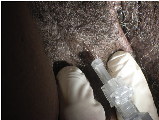
Fig. 1. To anesthetize the skin for a punch biopsy, inject lidocaine solution (1%–2%) with epinephrine into the dermis to raise a bleb in the skin under the lesion and beyond its edges.

After the biopsy, apply moderate pressure and, possibly, a hemostatic agent to stem bleeding, such as aluminum chloride, silver nitrate, or Monsel solution. Keep in mind that the latter 2 agents may cause tissue tattooing. 3 Monsel solution may produce tissue artifacts that can be troublesome to the pathologist if rebiopsy or further excision of a lesion becomes necessary. 4 Electrocautery can also be used to stop bleeding. Consider closing the biopsy site with a cyanoacrylate tissue adhesive, Steri-Strips, or an interrupted suture ( Fig. 4 ), especially with larger biopsies (>4 mm), to decrease postprocedure pain and improve cosmesis. Suturing with absorbable sutures may eliminate the need for removal, but stiff sutures often irritate the vulva, making silk sutures preferable, especially on mucous membranes.