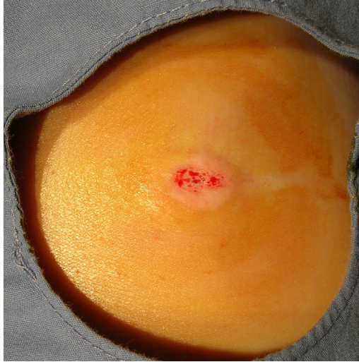
Fig. 5. After a shave, the base should be in the dermis with multiple bleeding points before hemostasis, have no subcutaneous fat apparent, and not have any apparent lesion remaining.

has been reported. The carbon dioxide (CO 2 ) laser may be used to ablate fenestration or excise the gland. If a patient's Bartholin gland cyst ruptures spontaneously, only hot sitz baths during resolution are needed. 15 Antibiotics are only necessary when secondary infection develops or sexually transmitted infections are identified. 15 Regardless of the method used, the provider and any assistants should take personal-protection precautions and wear gloves and eye equipment during these procedures.