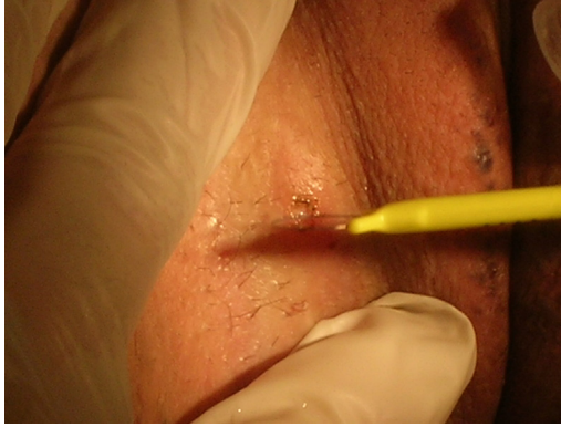
Fig. 9. During an electrosurgical shave, the loop is introduced into normal skin near the base of the lesion and pulled completely under the lesion through the dermis. Any remaining lesion is then carefully shaved down to the dermis using the side of the loop and fine paint-brush style cuts. Note that a cervical loop is used here for visualization, but shorter skin loops are easier to use.

preparation should be thoroughly washed off 1 to 4 hours after application to reduce local irritation. Podophyllin resin preparations differ in the concentration of active components and contaminants.