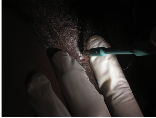
Fig. 2. Create an oval or elliptical defect by stretching the skin perpendicular to the lines of least skin tension with the nondominant hand during the procedure.