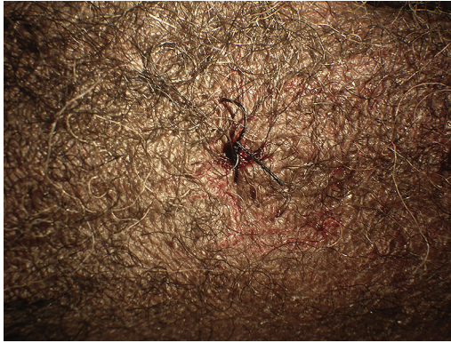
Fig. 4. Consider closing the biopsy site with an interrupted suture, especially with larger biopsies (>4 mm), to decrease the postprocedure pain and improve cosmesis. Stiff sutures often irritate the vulva, making silk sutures preferable, especially on mucous membranes.