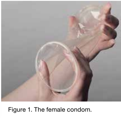
Figure 1. The female condom.

series is based on the publication Contraception: an Australian Clinical Practice Handbook, 3rd ed. , published by the Family Planning Organisations of New South Wales, Queensland and Victoria. 4