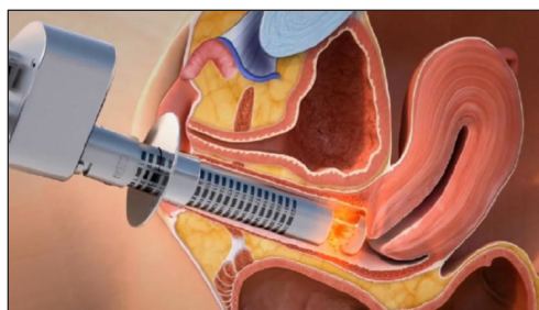
FIGURE 3 Fractional CO 2 laser treatment

The probe is slowly inserted to the top of the vaginal canal and then gradually withdrawn, treating the vaginal epithelium at increments of almost 1 cm.