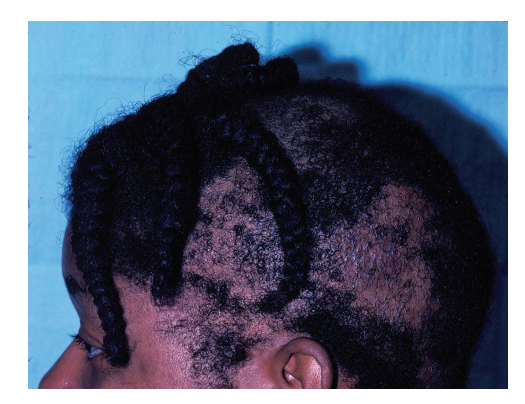
Figure 6. Hair loss from trichotillomania.

Patients with telogen effluvium may have