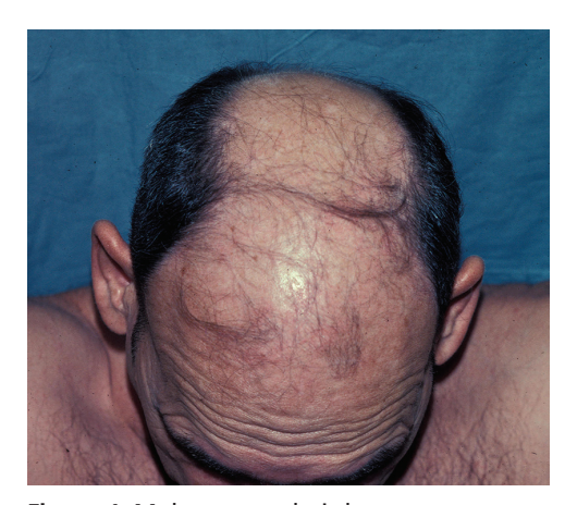
Figure 1. Male pattern hair loss.

Minoxidil and oral finasteride are the only treatments currently approved by the U.S. Food and Drug Administration for the treatment of androgenetic alopecia. Both of these drugs stimulate hair regrowth in some men, but are more effective in preventing progression of hair loss. Although there are a number of other treatments listed in various