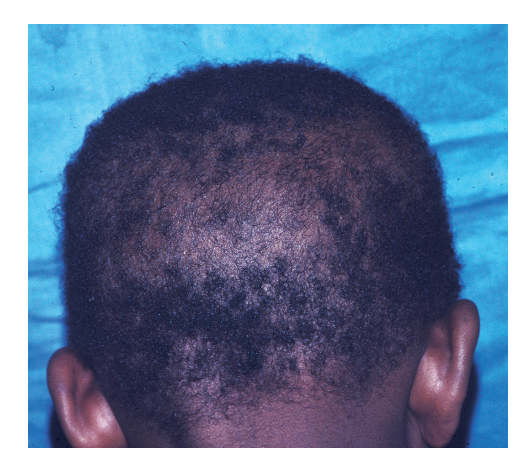
Figure 7. Hair loss from trichorrhexis nodosa.

Trichorrhexis nodosa occurs when hairs break secondary to trauma or because of fragile hair (Figure 7). It affects the proximal hair shaft, although the distal shaft may also be involved.20 Causative traumas include excessive brushing, heat application, tight hairstyles, trichotillomania, and conditions that cause excessive scalp scratching. Chemical traumas include harsh hair treatments (e.g., excessive use of bleach, dye, shampoo, perms, or relaxers21) and excessive exposure to salt water. Examples of congenital or genetic