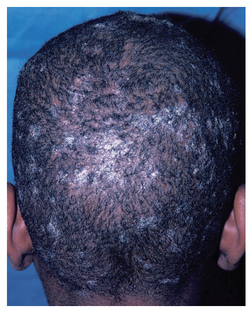
Figure 5. Hair loss from tinea capitis.

Treatment for adults with less than 50% of scalp involvement is intralesional triamcinolone acetonide injected intradermally using a 0.5-inch, 30-gauge needle. Maximal volume is 3 mL per session.11 Treatment may be