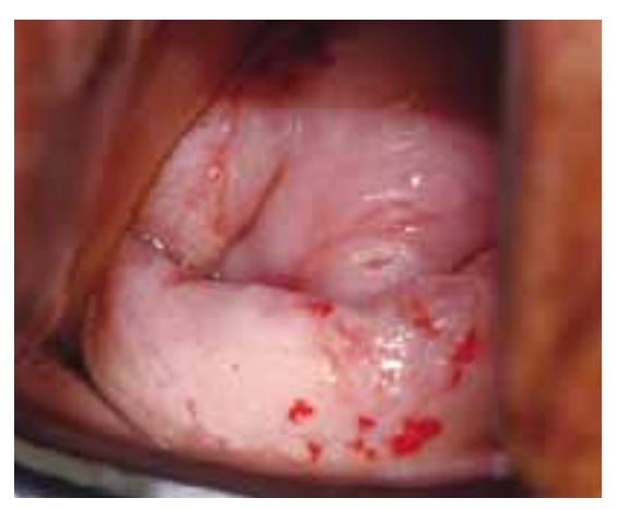
Note the hyperkeratotic, prominent appearance of the VAIN lesions.