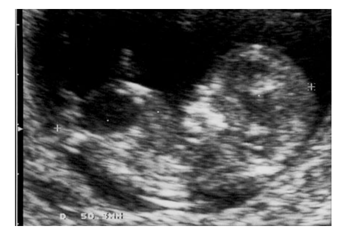
Figure 1 A 12-week fetus with megacystis.

A computer search of the database was made to identify all singleton pregnancies with fetal megacystis at the 10–14-week scan. The prevalence of chromosomal abnormalities and pregnancy outcome were examined in relation to the longitudinal diameter of the fetal bladder.