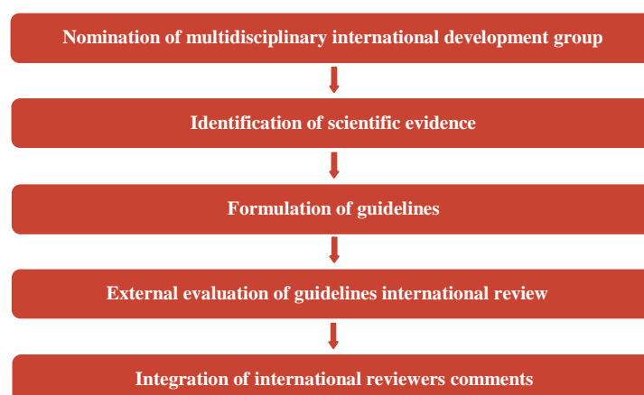
Figure 1. Development process